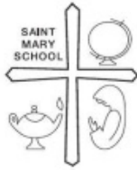
St. Mary Alexandria